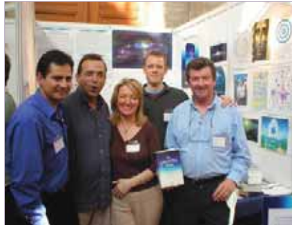
Book fair in London, UK

The DC also created a Book Fair project in response to one of its Bylaw mandates. This UAI project is offered in conjunction with Urantia Foundation's Reader Services. It encourages members to give booth presentations in appropriate venues, for example librarian's conventions and book Expos. It offers a booth kit with Foundation translations and other materials for display. And it offers a network of experienced