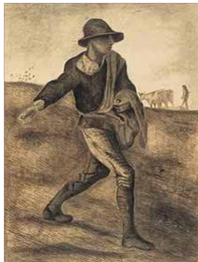
"The Sower" Vincent Van Gogh, 1881

seminate? To whom? In what way? And how does the work of UAI's Education and Study Group Committees impinge on and relate to the DC's? Studying, discussions with a wide spectrum of members and officers, and winnowing of ideas went on for two years as one dissemination strategy after another was either adopted or discarded.