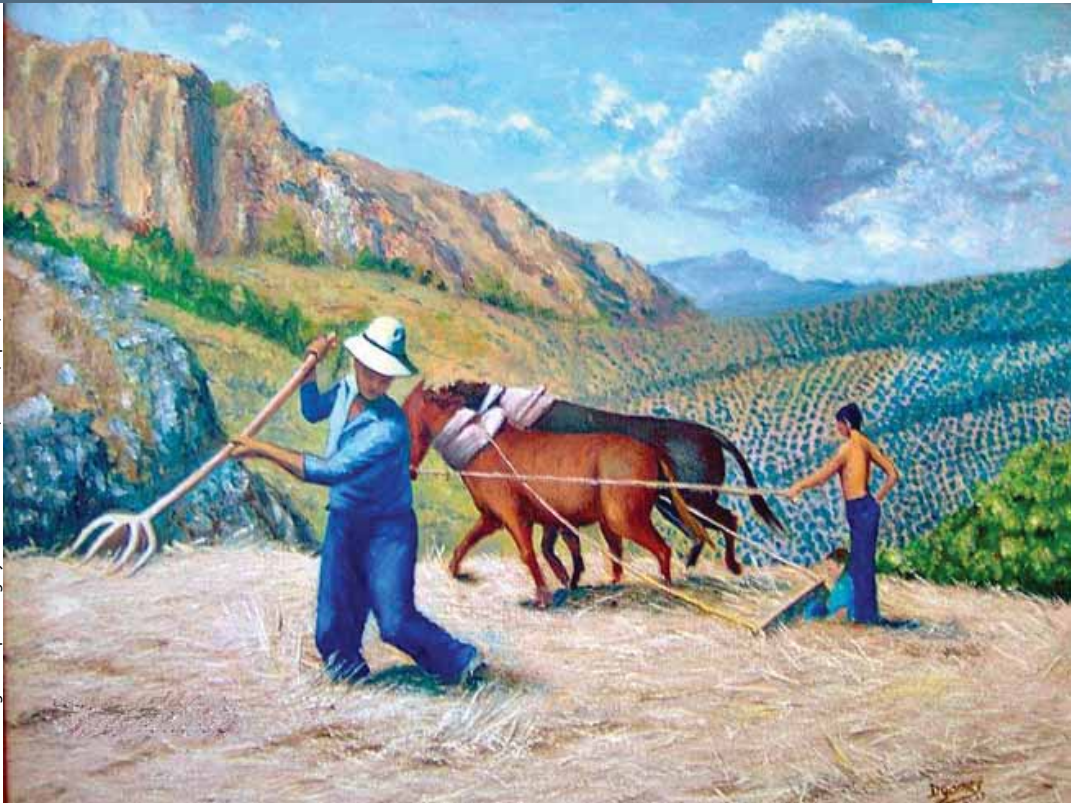
"The threshing floor" painting by Demetrio Gomez (Madrid, Spain)