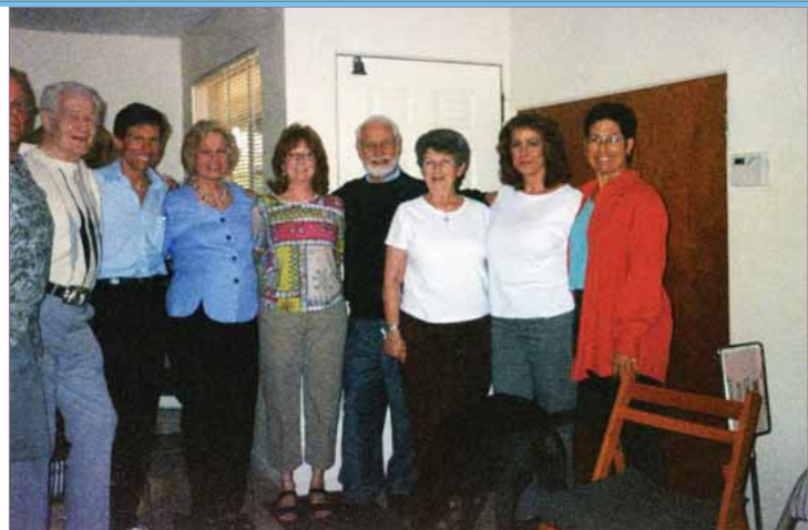
Arizona group photo

Toby Fox did a presentation titled, "The Mastery of Communion," a how-to guide to removing the roadblocks to direct Adjuster communion. A foundation for mastery was built around achieving a mind of perfect poise, housed in a body of clean habits, stabilized