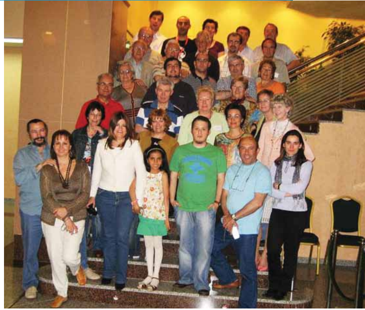
Group picture. More photos at http://www.urantia-uai.org/photos/index.html

As part of our program activities, as usual, we held an assembly of our Association, when we informed our members about international and national projects. Our